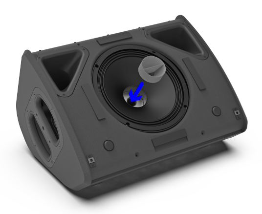
Grille removed, an optional magnetic horn can be quickly fitted to change directivity from 100°x100° to 110°x60°

P10 acoustic phase response is NEXO phase signature allowing inter-operability between all NEXO speakers at all crossover points, except for the monitor setups where latency is minimized.