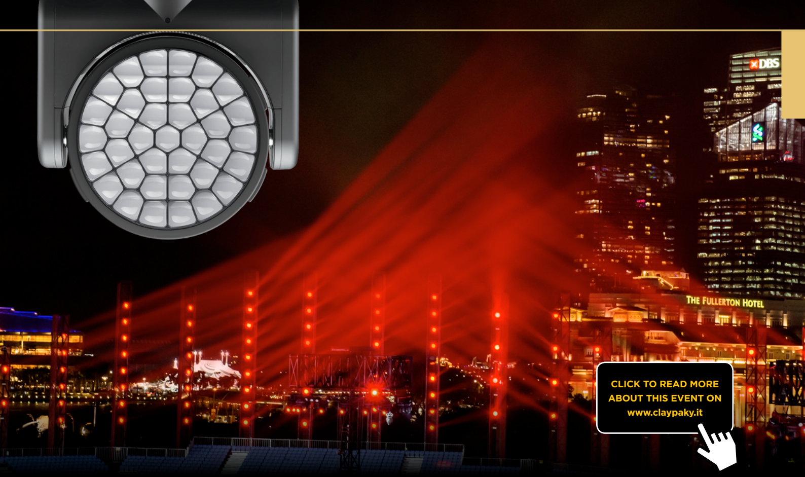
Singapore National Day Parade 2019