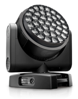
HY B-EYE K25 27.5 kg (60.6 lbs)

Creative effects produced by HY B-EYE and B-EYE